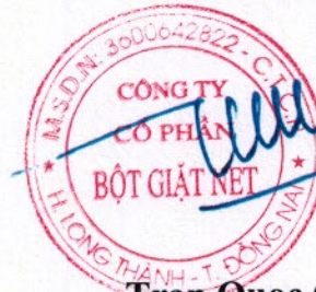
Tran Quoc Cuong