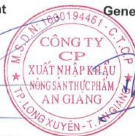
TANG VU GIANG