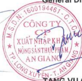
TANG VU GIANG