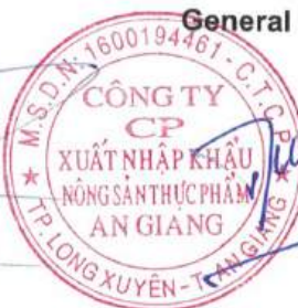
TANG VU GIANG