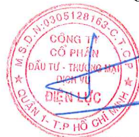
HOANG HUY HUNG