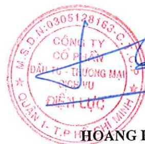
HOANG HUY HUNG