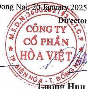
Luong Huu Hung