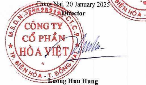
Lương Hữu Hưng