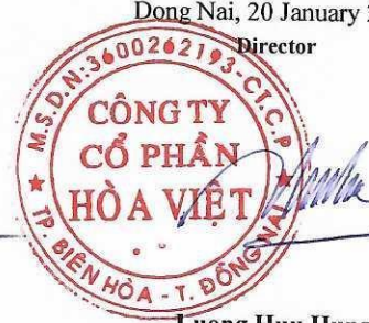
Luong Huu Hung