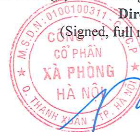
Le Viet Phuong