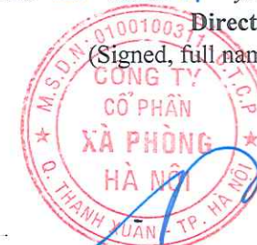
Le Viet Phuong