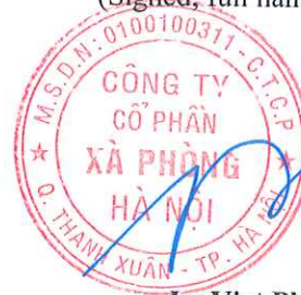
Le Viet Phuong