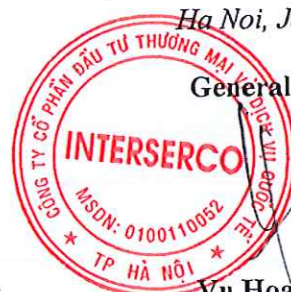
Vu Hoang Thao