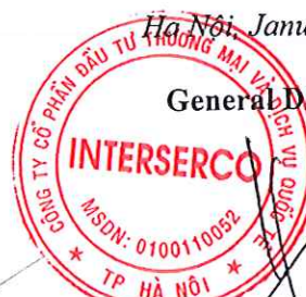
Vu Hoang Thao