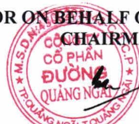
Tran Ngoc Phuong