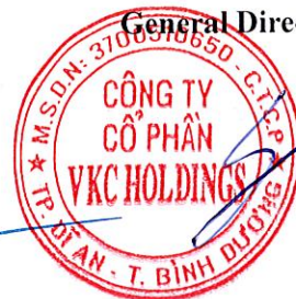
PHAM HOANG PHONG