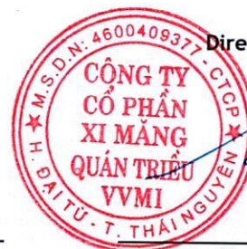
Tran Viet Cuong