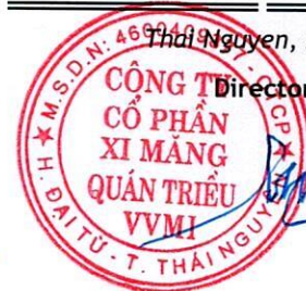
Tran Viet Cuong