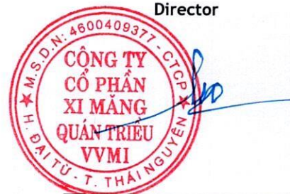
Tran Viet Cuong