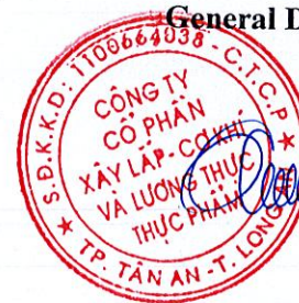
Le Trung Son