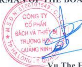
Vu The Hoa