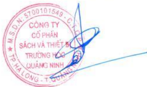
Vu The Hoa