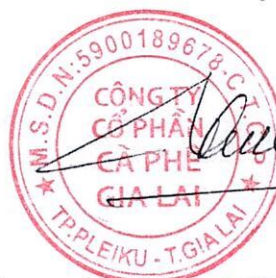
NGUYEN CONG TIEN