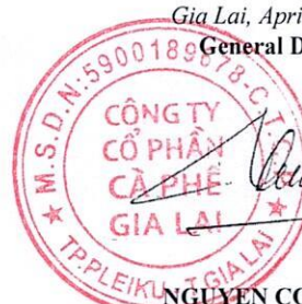
NGUYEN CONG TIEN