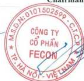
Pham Viet Khoa