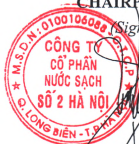
Duong Quoc Tuan