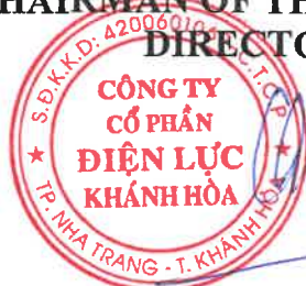
Nguyen Cao Ky