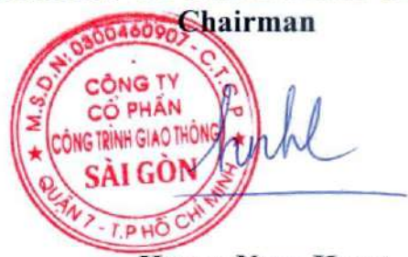
Hoang Ngoc Hung