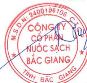
HUONG XUAN CONG