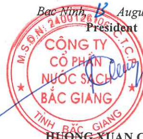
HUONG XUAN CONG