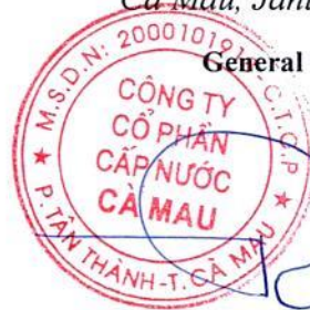
Pham Phuoc Tai